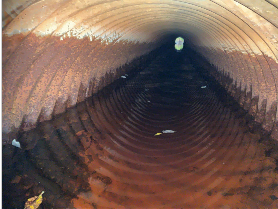
Figure 2.—Inside of culvert at waypoint 1238.