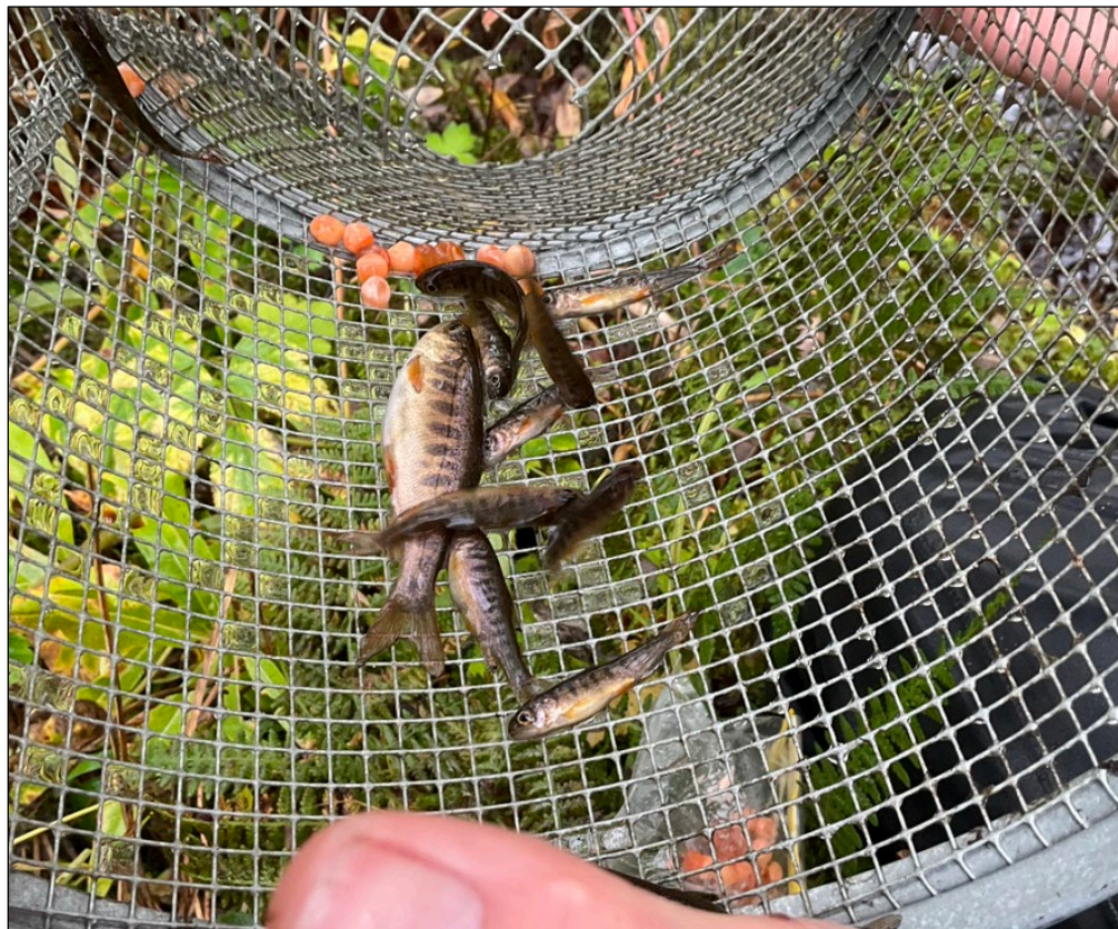
Figure 1.–Juvenile coho salmon and Dolly Varden captured at waypoint 1238.