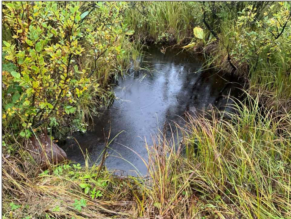
Figure 3.—Culvert upstream of the road.